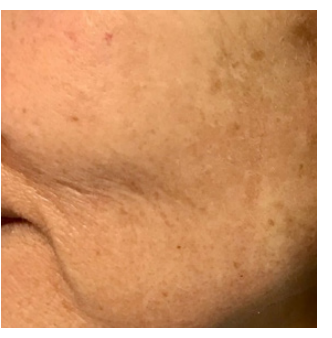
DAY 0 F