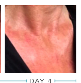
Immediately following treatment using competitor products.