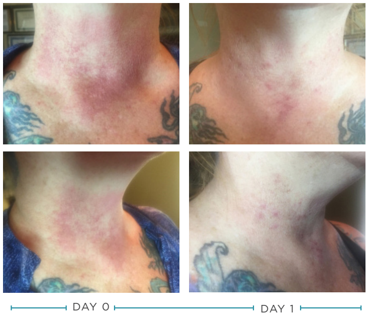
Immediately following treatment